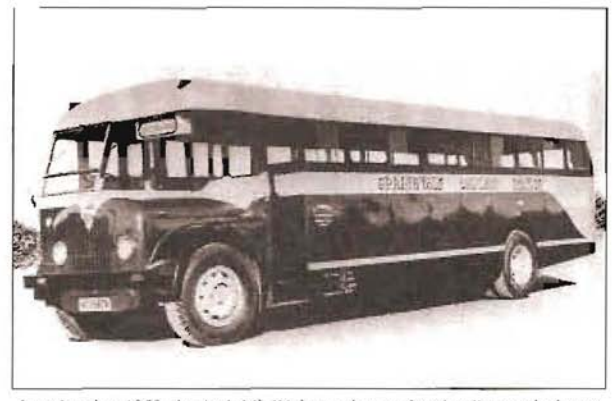
Introduced in 1950, the Arab Mk.IV featured an enclosed radiator, which was adopted by Birmingham City Transport for their buses bought in the 1950's.