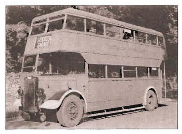
A typical utility double decker. This is 6LW powered Arab Mk.II chasis with a lowbridge body built in Leeds by Charles H Roe