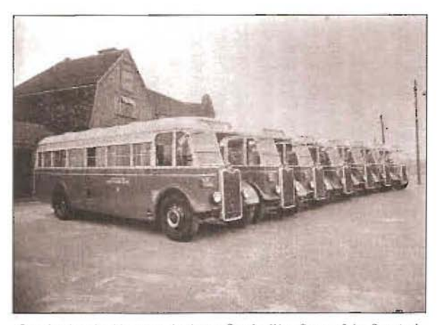
Guy developed a big export business after the War. Some of the first Arab Mk.III's went to Dar-es-Salaam Motor Transport in 1946 with duple bodies