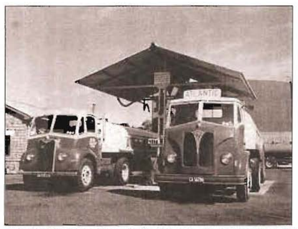
Atlantic Oils of Cape Town. Sonth Africa ran several Guy tankers. The Otter Diesel Mk.II tractor nmt is seen alongside an early Invincible Mk.1 powered by a 6LW engine, 1955.